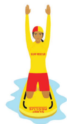
11. Emergency evacuation alarm