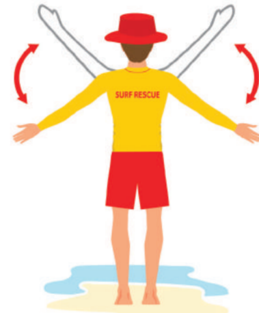
7. Pick up or adjust buoys