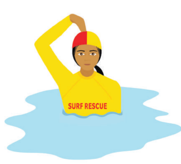
13. All clear/ok