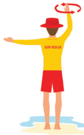
2. Pick up swimmers