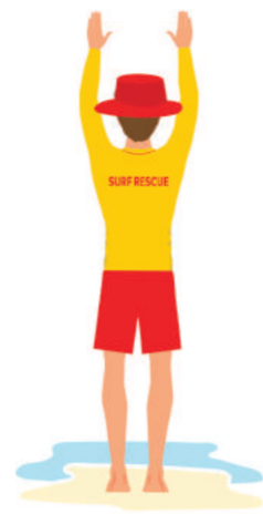
3. Proceed further out to sea