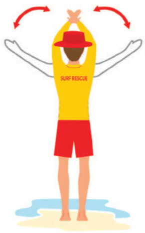
1. Attract attention