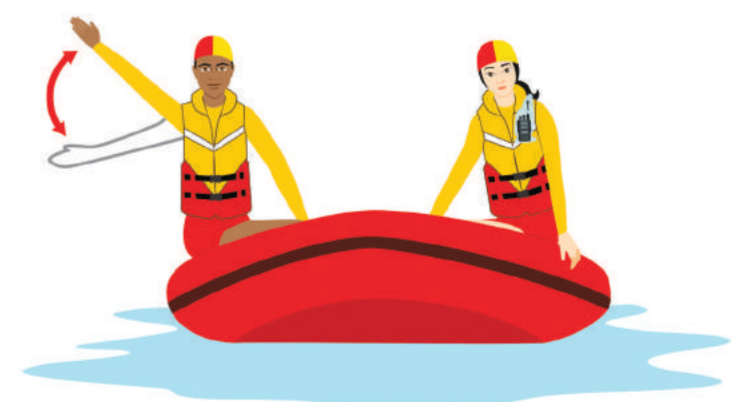
14. Powercraft wishes to return to shore