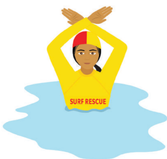
12. Submerged victim missing