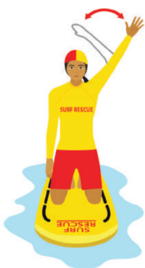
9. Assistance required