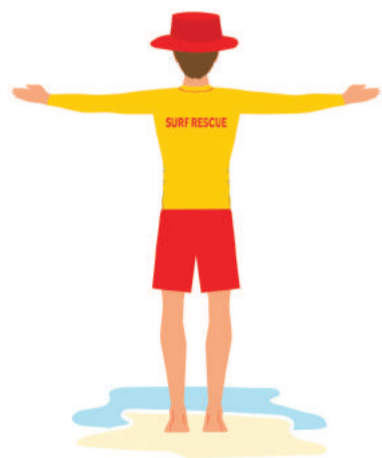
5. Remain stationary