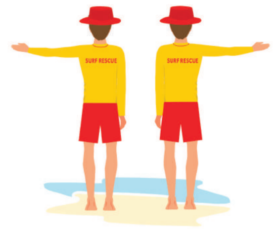
4. Go the right or to the left