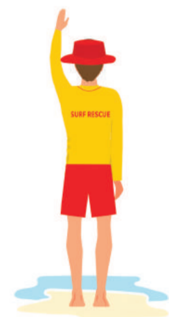
8. Return to shore